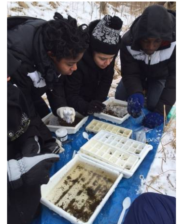
Marygrove College students look for stoneflies at Johnson Creek

All but three of the ten sites with stoneflies were in the Johnson Creek watershed. Four of these were on Sump Creek, a Johnson Creek tributary in and around Maybury State Park. The highest number of stoneflies at one site was at MR-22 with 22 stoneflies. Both sites with Perlodid stoneflies were on Sump Creek. Two other Johnson Creek sites had stoneflies – John1 at Five Mile and Salem Road and John7 in the Arcadia Ridge subdivision. Surprisingly, the Marygrove College team at John1 also found a Rhyacophilid caddisfly, a type of caddisfly first identified in Michigan through Friends of the Rouge's program. Usually found in April, this is the earliest in the year they have been found.