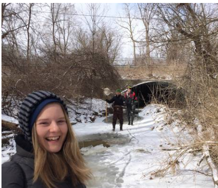
Wayne State University students on the Lower Rouge

On the Lower Rouge, Fellows Creek had one site with stoneflies (LR-9) and Fowler Creek had two sites with them (Fowl1 & Fowl2). Fowl2 has not had stoneflies since 2011.